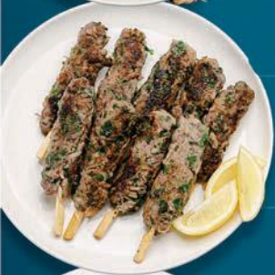
LAMB AND BEEF KAFTA