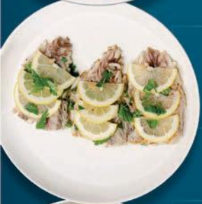
GRILLED FISH FILLETS IN A BUTTER AND LEMON HERB SAUCE