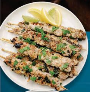
BBQ PORTUGUESE CHICKEN