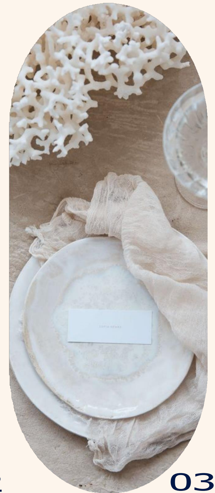
03 VOW RENEWAL